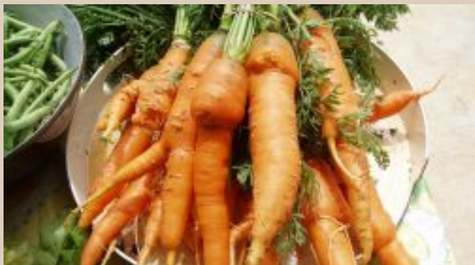
Sweet carrots grown locally in Leicester, NC.