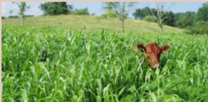
Hickory Nut Gap Farm is one of the many that are a part of the Appalachian Sustainable Agriculture Project.