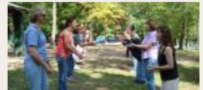
Staff were invited to bring their family members for a meal, games and prizes at our 2009 summer employee picnic. Here everyone lines up for a water balloon tossing game.