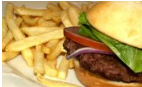
Pub Night featured many items, including homemade sliders (mini burgers).

Introducing Pub Night has given our members another choice in dining options, allowed for more creativity for our team of chefs and has brought a new level of service and fun to Ardenwoods. Creating memorable dining experiences is another way that we can enhance social wellness in our community. The next time you want a night out without going anywhere, join us for Pub Night.